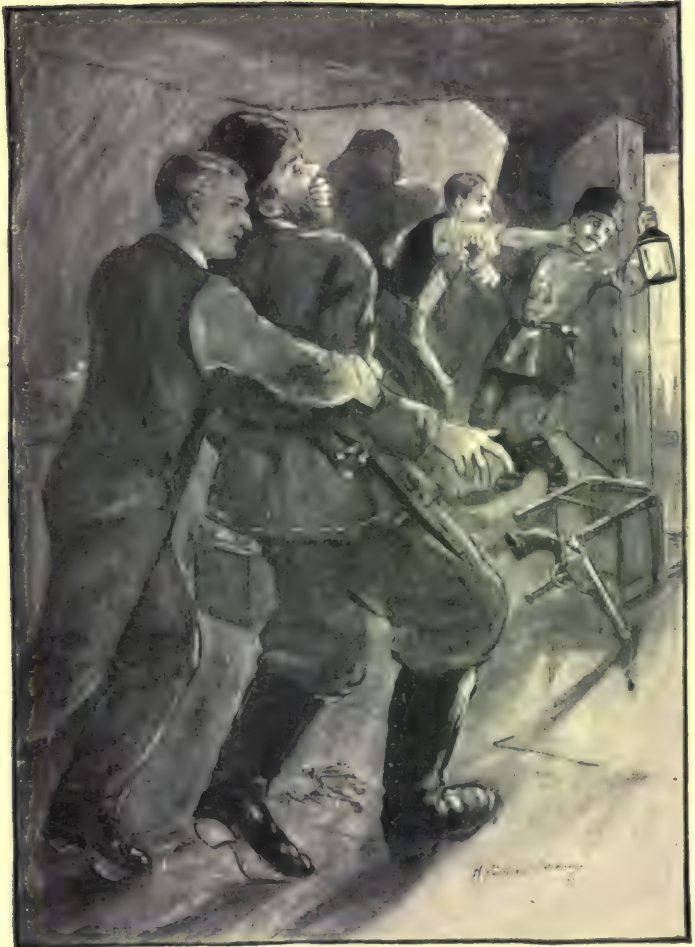
JACK CLAPPED ONE HAND ACROSS THE FELLOW'S BEARDED LIPS AND WOUND HIS OTHER ARM ABOUT THE STALWART BODY.— Page 287